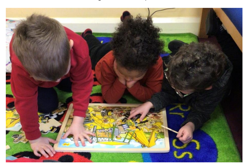
We have had some very special visitors!