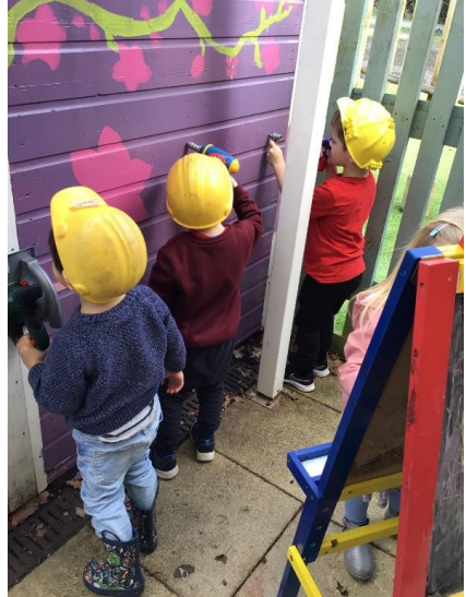
Fixing the house!